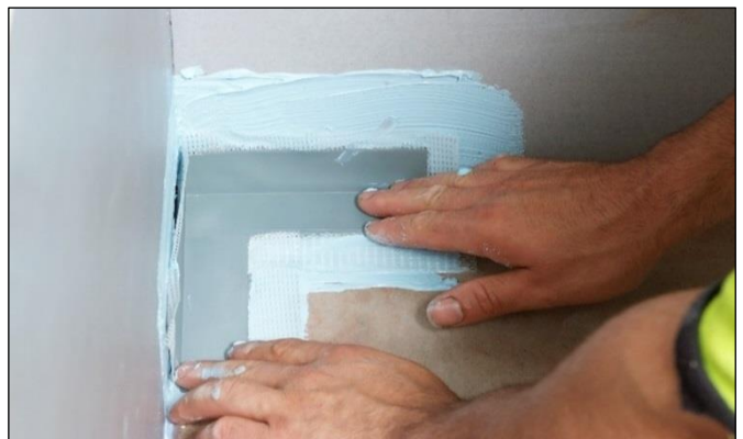
Installing Elastoproof Prefabricated Corners

IMPORTANT: Suitable Gripset liquid membranes can be used as an alternative for fixing the Elastoproof bond breaker system and sealing overlaps based on the application for which the GC2 is to be used. For example, for under tile applications to external wet areas the Elastoproof bond breaker system can be fixed using the Gripset 38 FC Membrane. For immersed applications Gripset C-1P can be used. When using a liquid membrane, extend up perimeter walls and onto GC2 Membrane to 150mm and bed Joint Band and Corners into a wet coat of membrane. Once in place, brush the membrane over the face and onto all edges of the Joint Band adhering to the GC2 sheet, to fully seal the lip of the Joint Band and GC2 sheet.