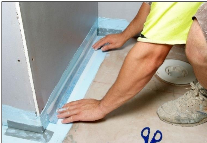
Installing Elastoproof B50 Bond Breaker Joint Band