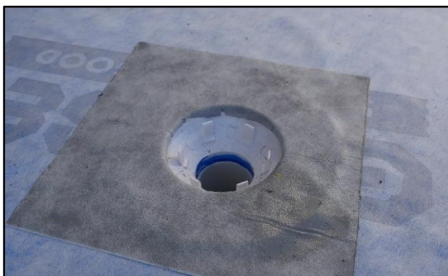
Elastoproof Butyl Square over leak control flange