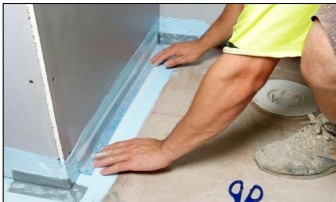
Installing Elastoproof B50 Bond Breaker Joint Band