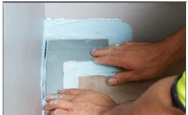
Installing Elastoproof Prefabricated Corners

For floor pipes protruding floors, Elastoproof Collars are to be fitted over the neck of the pipe bonding the collar to the GC4 membrane within a wet bed of GC Pro Adhesive or Gripset 38 FC Membrane. Once fixed seal edges of the collar to the GC4 sheet by brushing out the GC Pro Adhesive or Gripset 38 FC Membrane. For leak control flanges, Elastoproof Butyl Squares are to be fitted directly over ensuring the interface between GC4 sheet and edge of flange is covered.