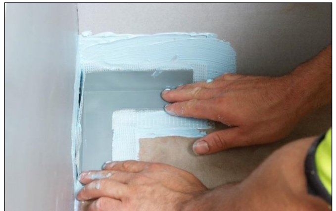
Installing Elastoproof Prefabricated Corners

Measure and cut Elastoproof Joint Band for all wall/floor junction areas. Apply first coat of Gripset 2P membrane to extending 150mm up walls and on to floors, and embed Elastoproof Joint Band into wet bed of liquid membrane, ensuring fabric edges are fully wet out and no air bubbles exist behind the fabric. Rear rubber section of Elastoproof Joint Band is not bonded to substrates. At sections where Joint Band is to be joined, a minimum 50mm overlap is required. Elastoproof Prefabricated Corners are available for both internal (90°) and external (270°) junctions, enabling Joint Band to overlap and avoid joint at critical areas. If Prefabricated corners are not used, Elastoproof Joint Band is to have bottom leg cut and folded; ensuring fabric is completely bonded with Gripset 2P membrane.