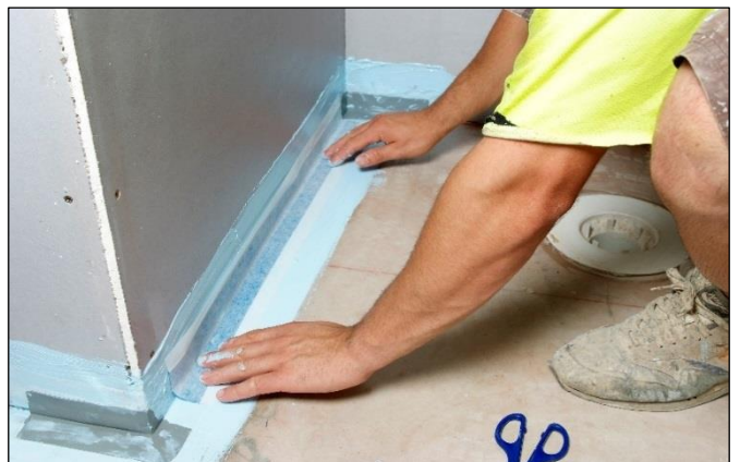
Installing Elastoproof B50 Bond Breaker Joint Band